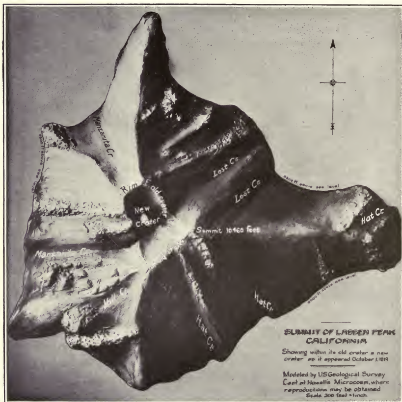
FIG. 2.—Summit of Lassen Peak, Cal., above the 9,500-foot contour, as seen from above, showing the summit spurs radiating from the rim of the old crater, within which the small new crater (white), as it appeared October 1, 1914, contains a jet of steam.

By far the greatest eruptions that have occurred at Lassen Peak since its present activity began are those of the night of May 19 and